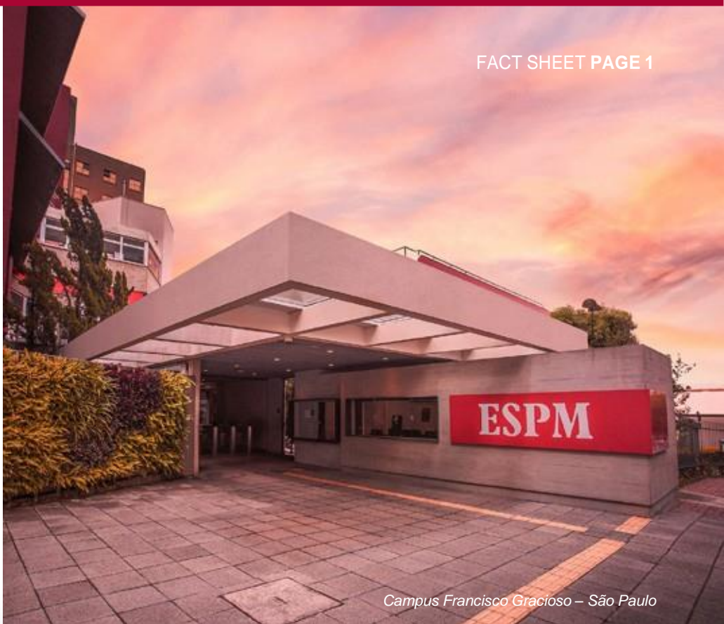
Campus Francisco Gracioso – São Paulo