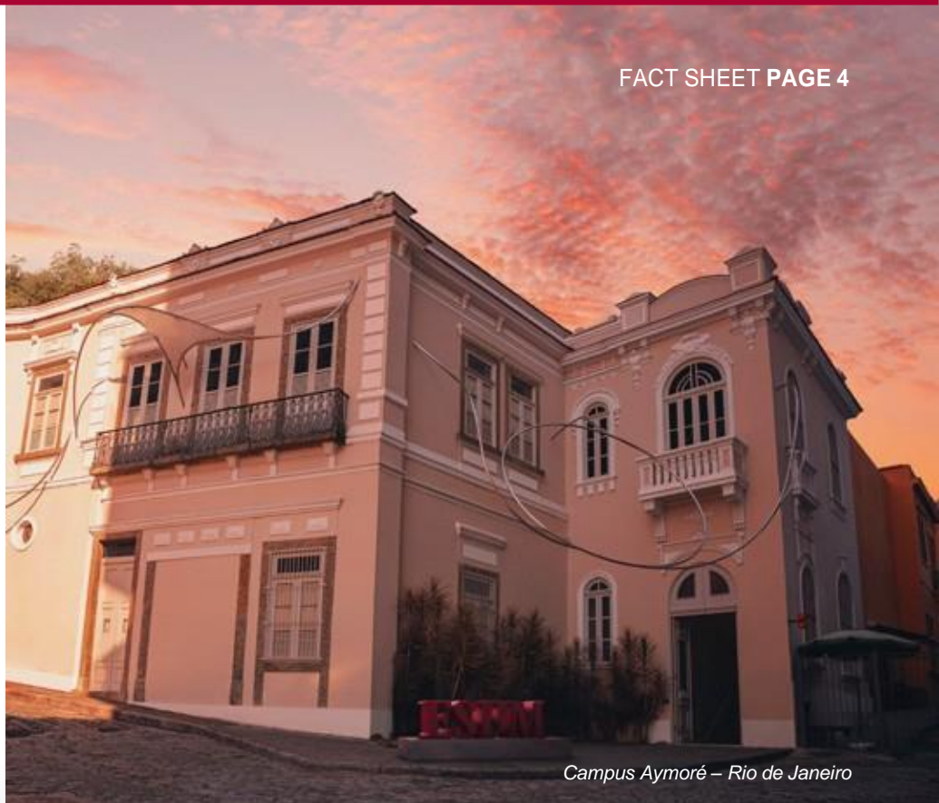
Campus Aymoré – Rio de Janeiro